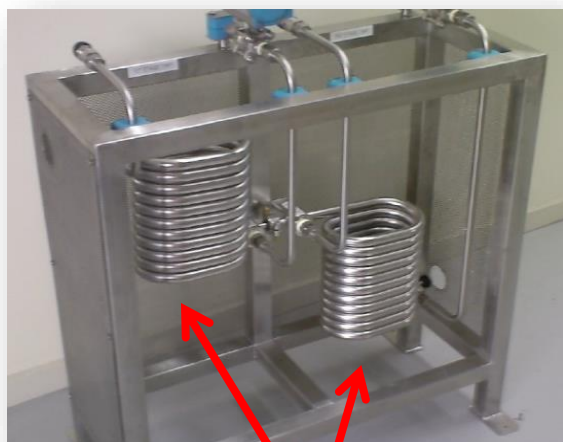
2 X Model 00644-01